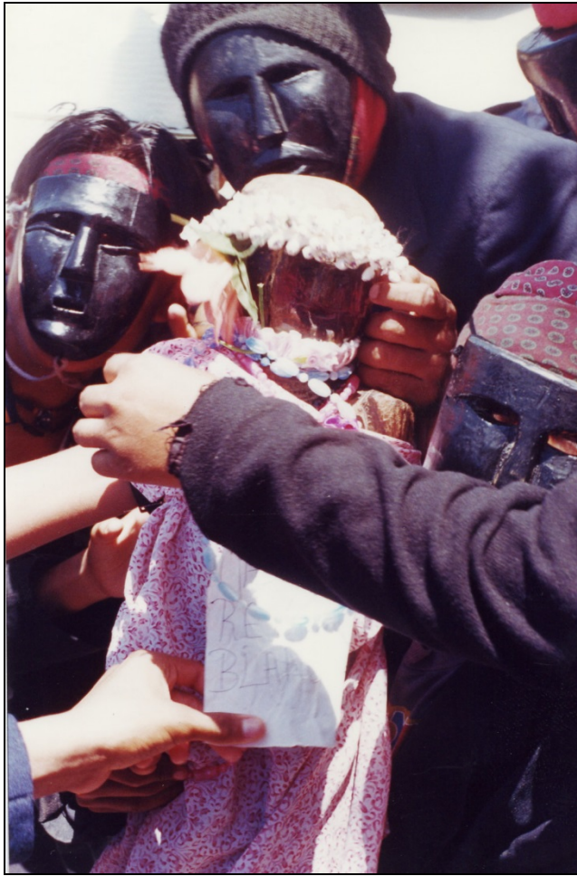
Boys in black masks with the “kidnapped princess”; boys dressed as Turkish pirates and Catholic kings; women on their way to a town dance