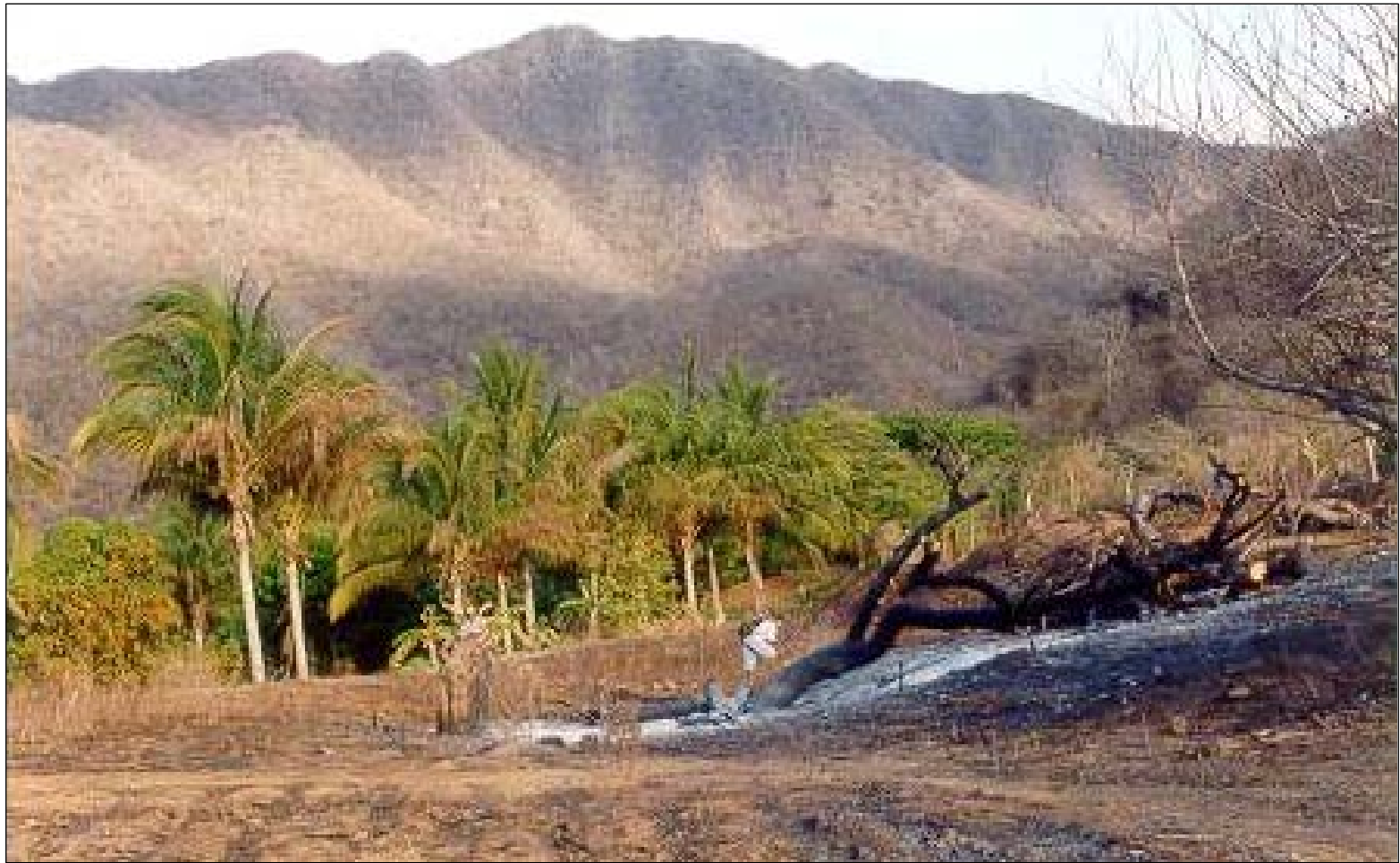
Looking for artifacts near San Pedro Huamelula, Oaxaca, Mexico