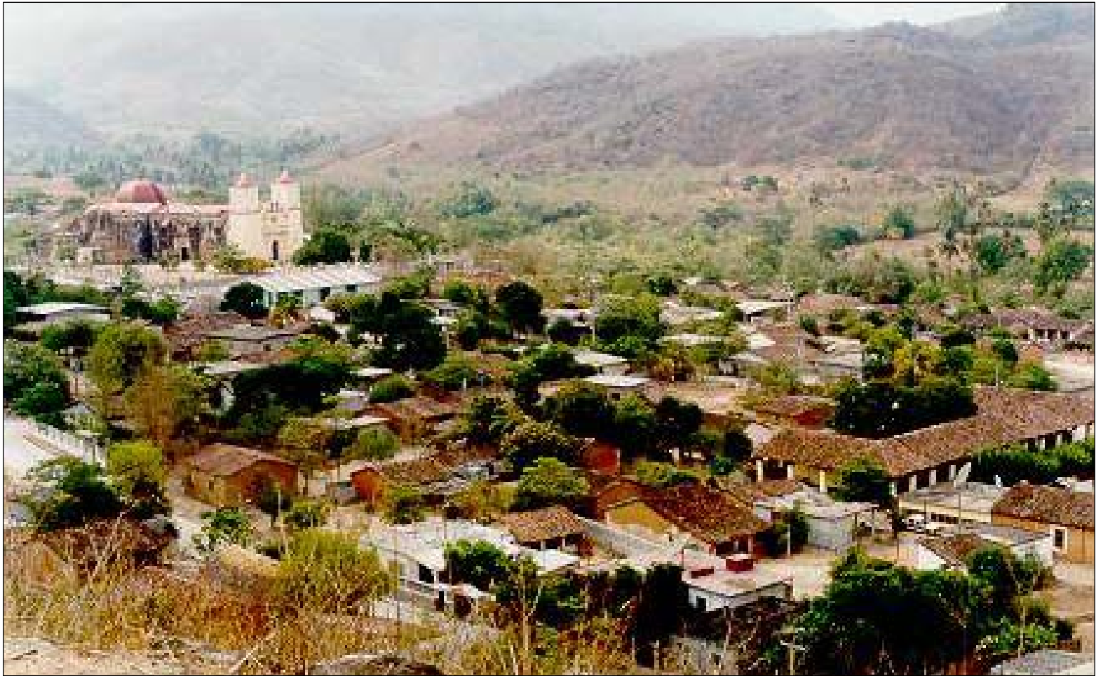
View from a hill top of San Pedro Huamelula, Oaxaca, Mexico