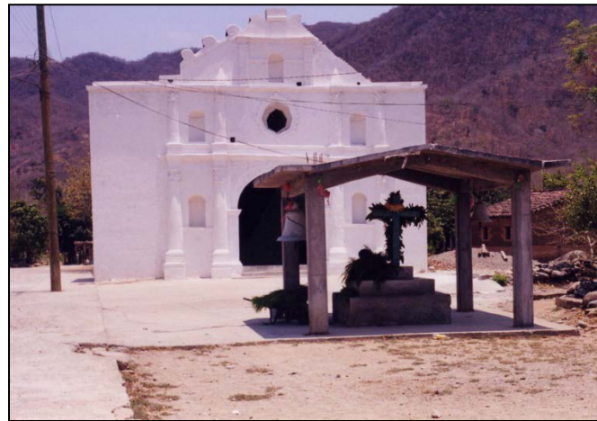
Almond tree, sugar cane parade, San Sebastian church